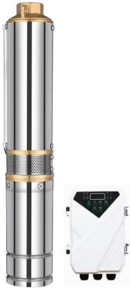
4" PLASTIC IMPELLER SOLAR SUBMERSIBLE PUMP